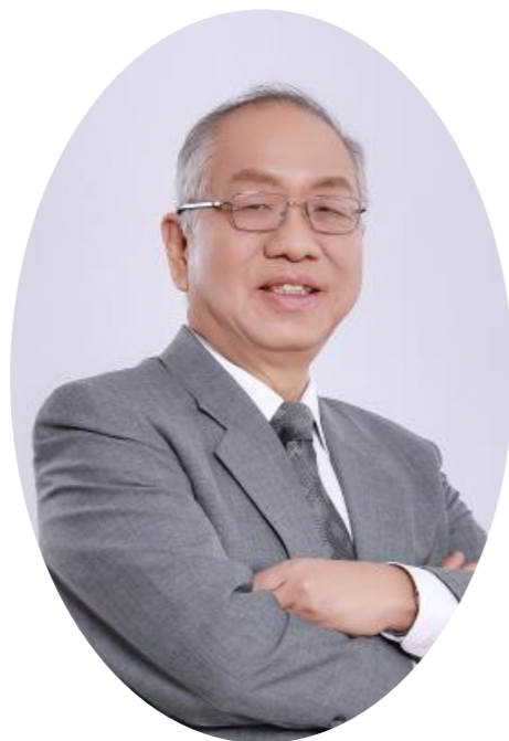
Shing-Tung Yau Harvard University

Professor Shing-Tung Yau is the William Casper Graustein Professor of Mathematics at Harvard University. He is the inaugural Director of the Yau Mathematical Sciences Center of Tsinghua University. Professor Yau has made fundamental contribution to differential geometry, differential equations and mathematical physics. He is a member of the United States National Academy of Sciences, a member of Russian Academy of Sciences, a foreign member of the Chinese Academy of Sciences, and a member of Academia Sinica.