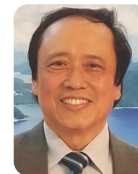
Shiu-Yuen Cheng Tsinghua University